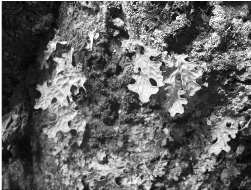
Figure 2. Lobaria pulmonaria : juvenile thalli on bark of living Fagus sylvatica (Mantaritsa Reserve, Pashino Bardo locality).

Lobaria pulmonaria could be regarded still as under-recorded.